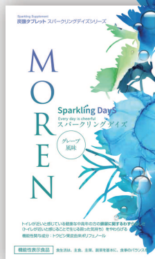
water chestnut extract